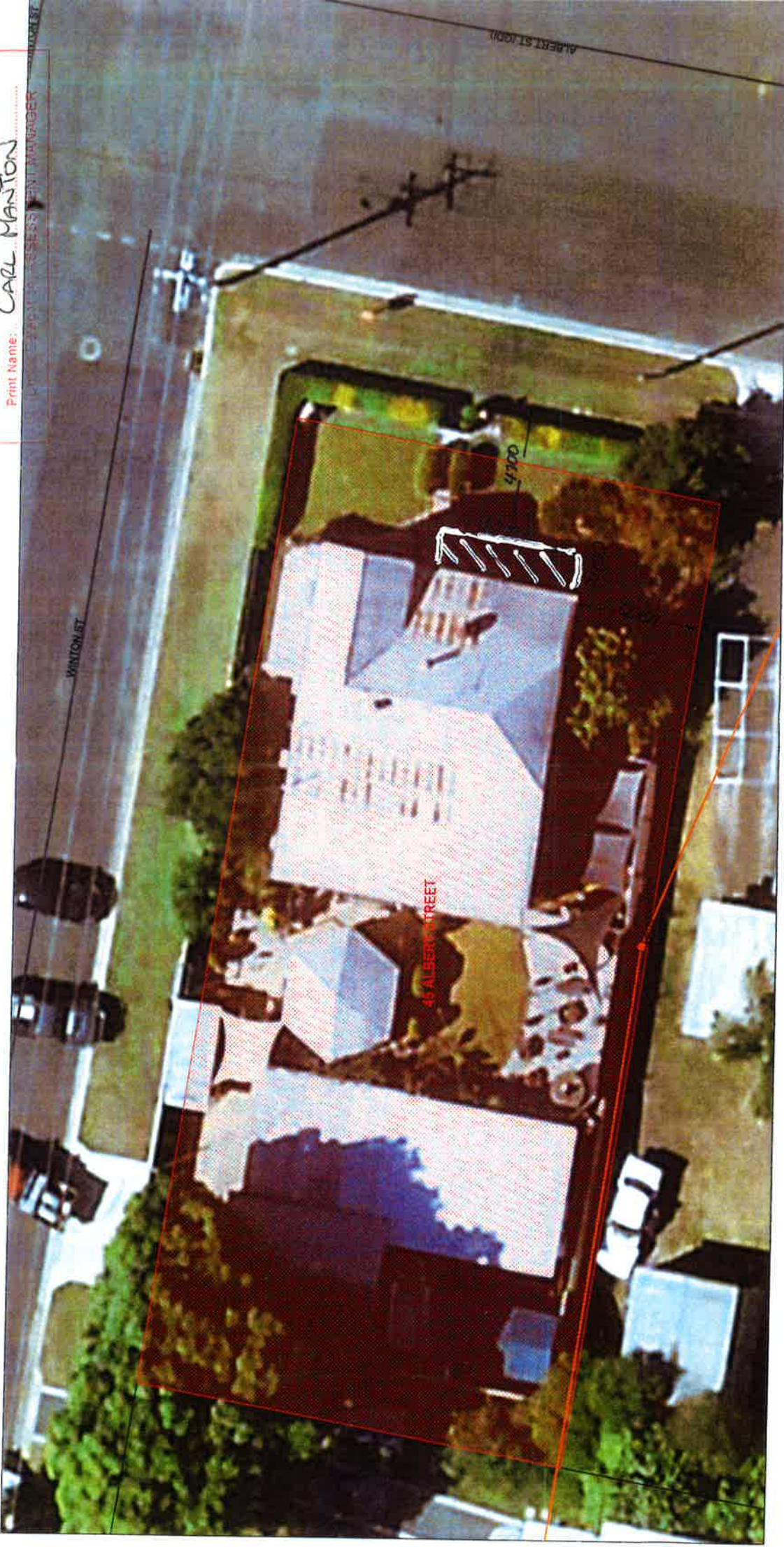
PROPOSED DECK ADDITION 45 ALBERT STREET, GOONDIWINDI