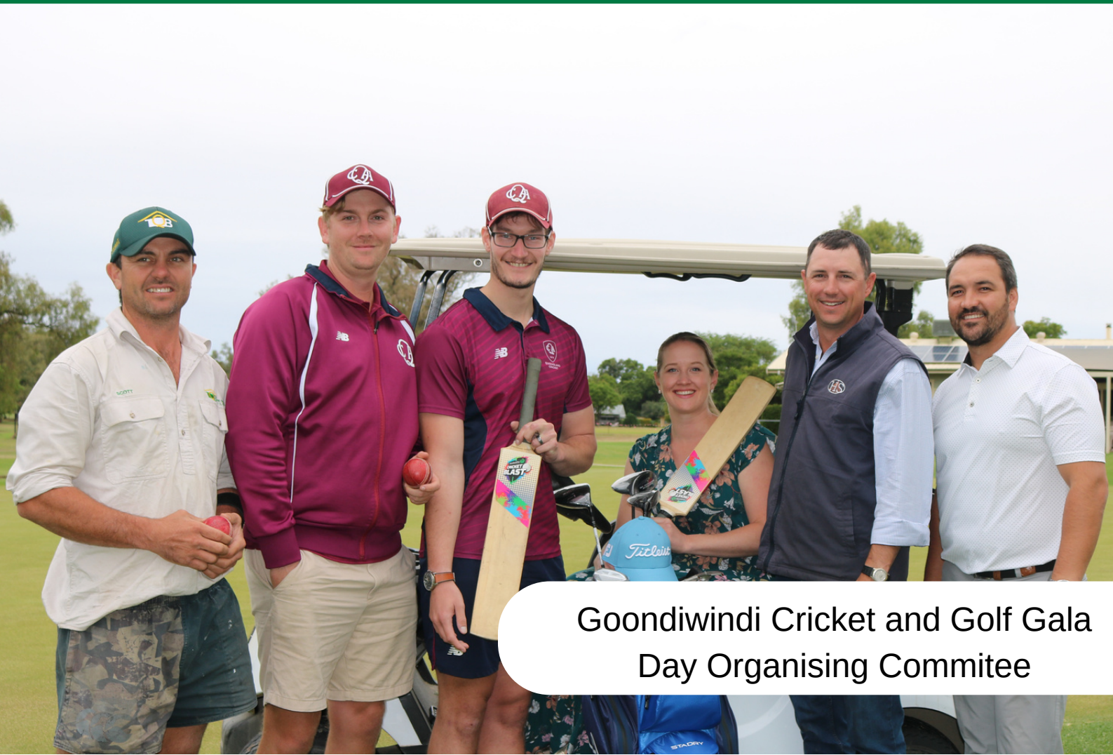
Goondiwindi Cricket and Golf Gala Day Organising Committee

Attracting and retaining volunteers - Strategic planning - Good governance