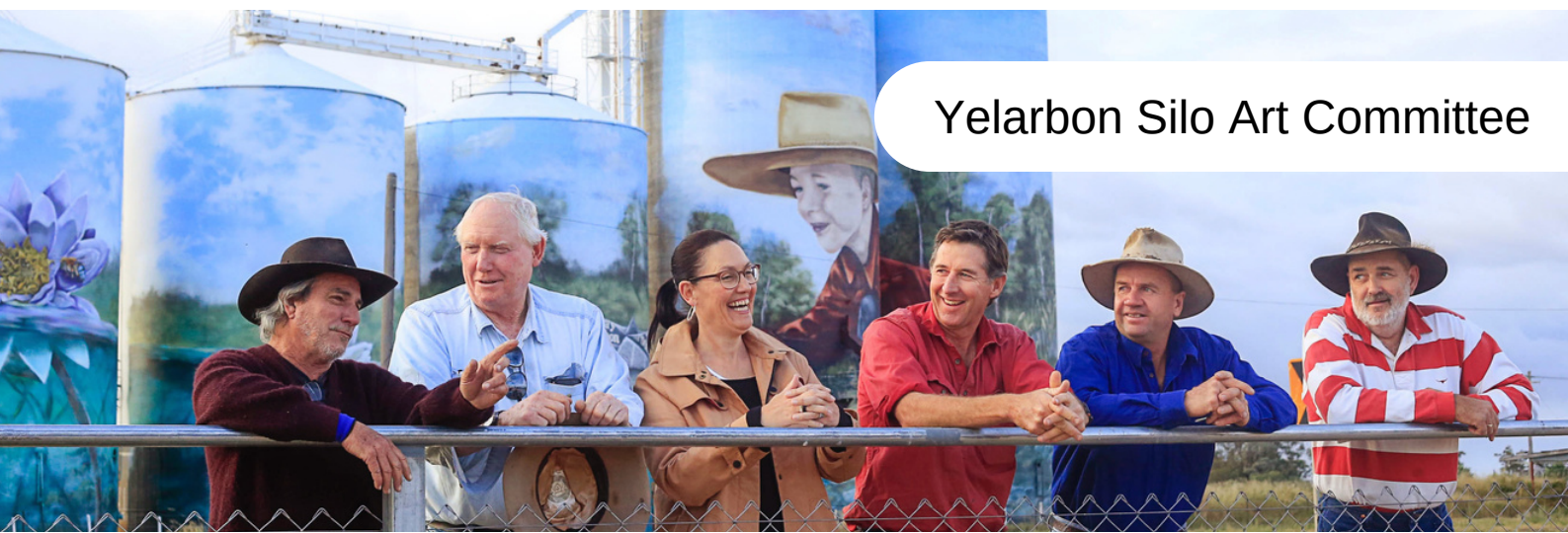
Yelarbon Silo Art Committee

Scan here for more information about Council's grants programs, and to submit an application