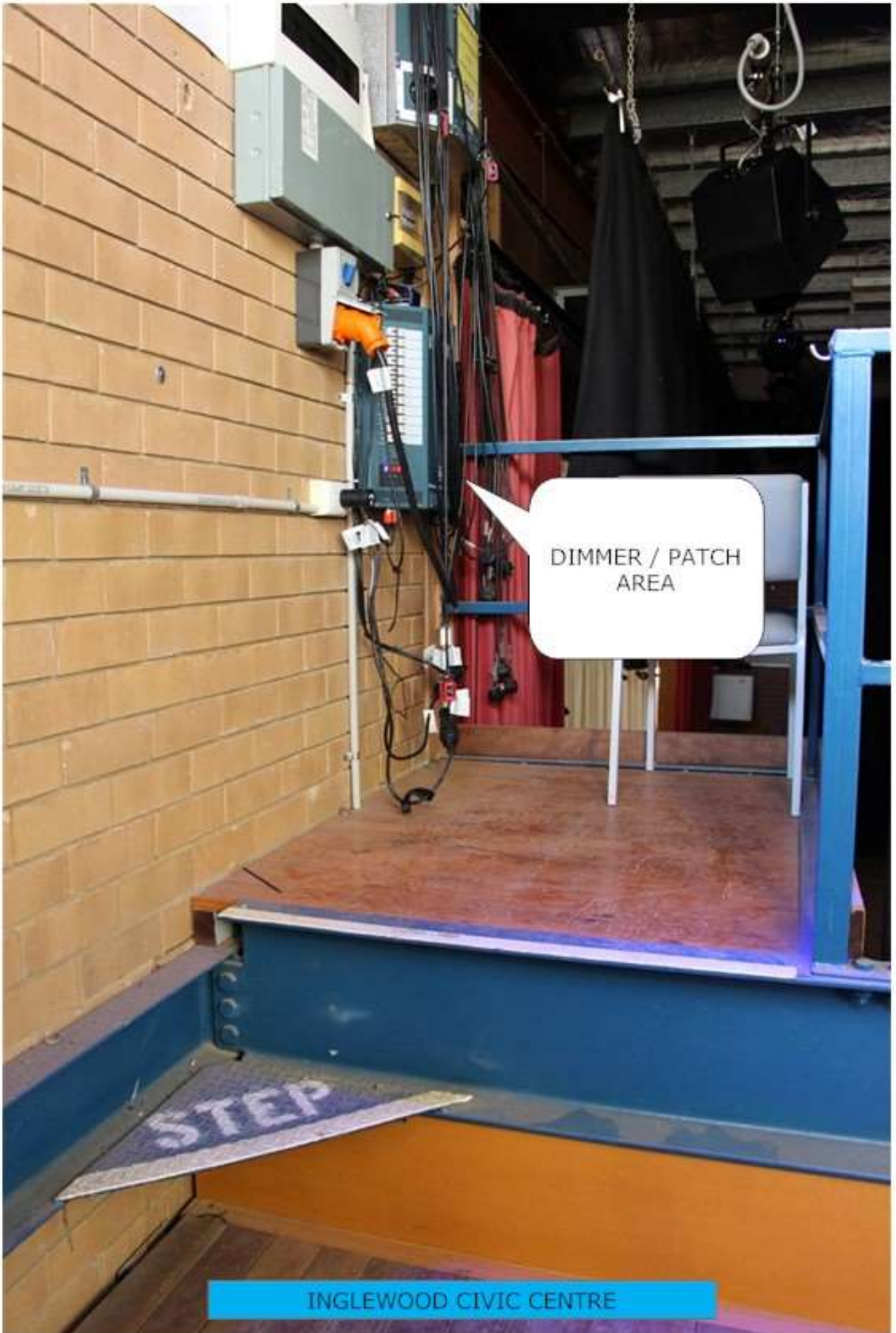
INGLEWOOD CIVIC CENTRE