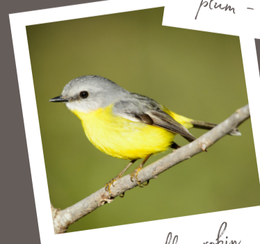
eastern yellow robin