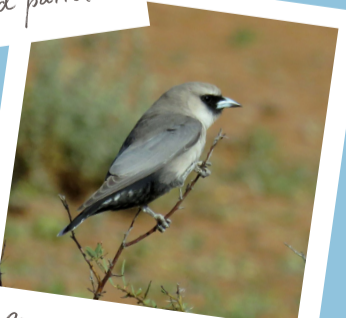
black - faced woodswallow