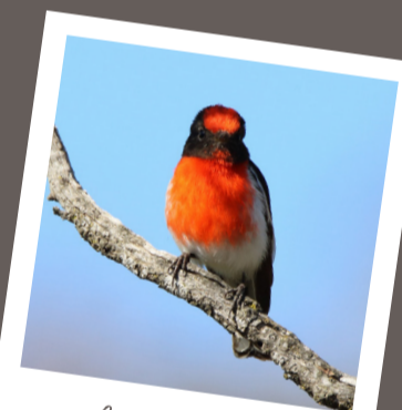
red - capped robin