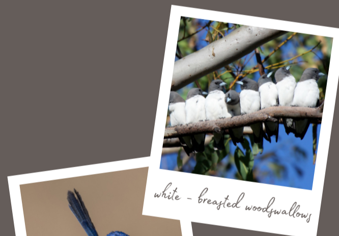
white - breasted woodswallows