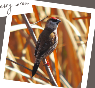
plum - headed finch