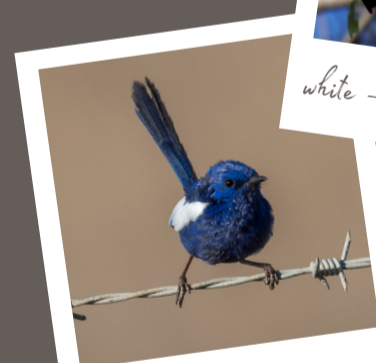
white - winged fairy wren