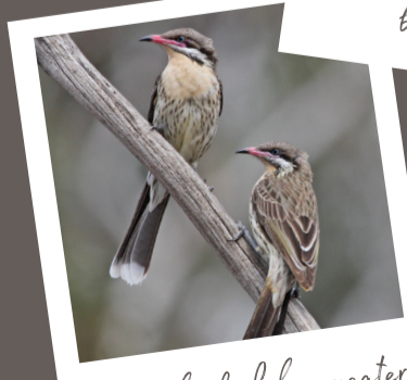
spiny - cheeked honeyeaters