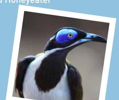
blue - faced honeyeater