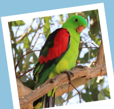
red - winged parrot