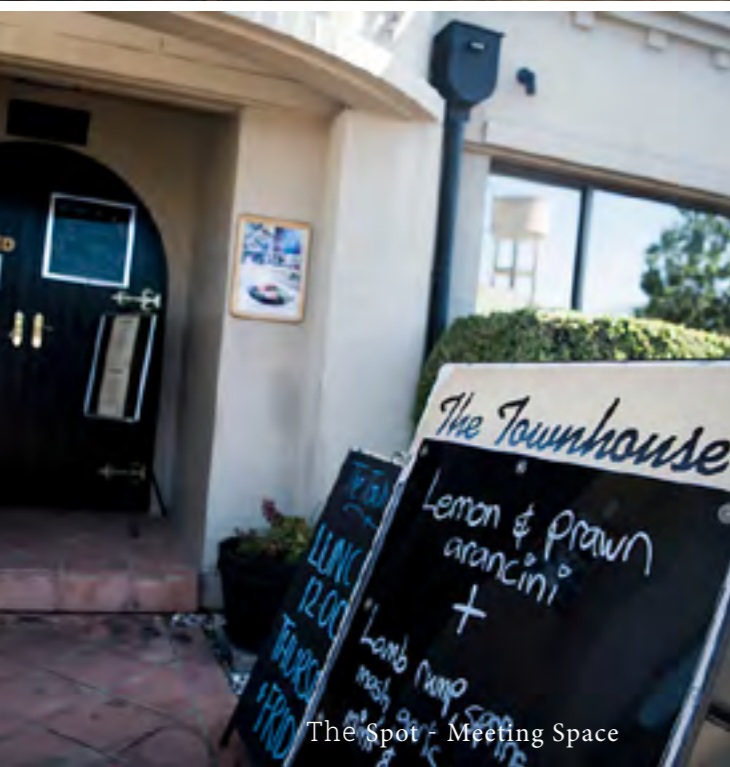
The Spot - Meeting Space