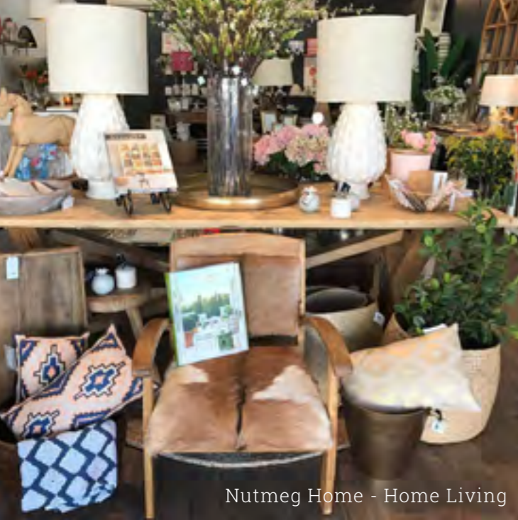
Nutmeg Home - Home Living