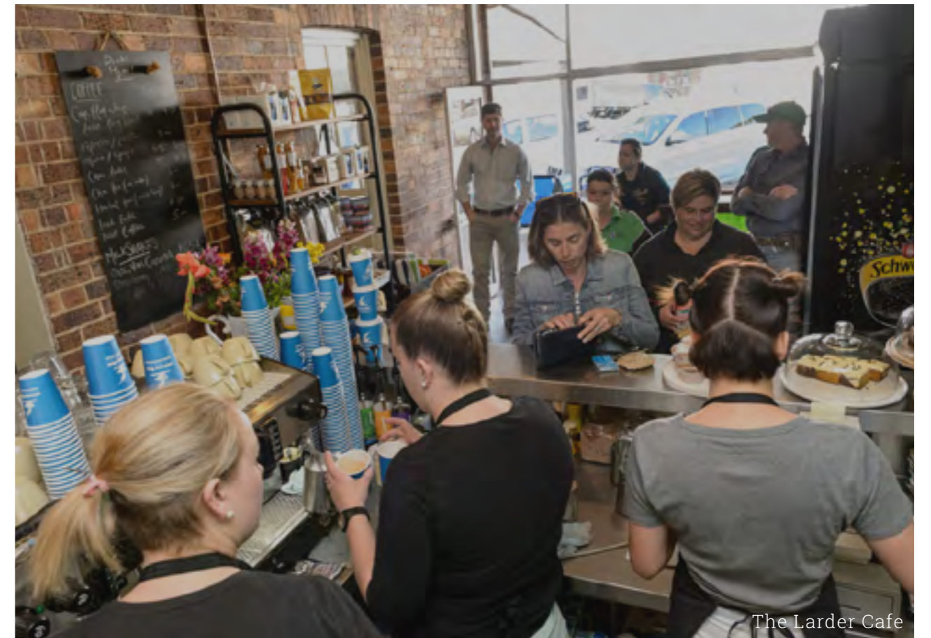
The Larder Cafe

There are currently 35 eating establishments across Goondiwindi!