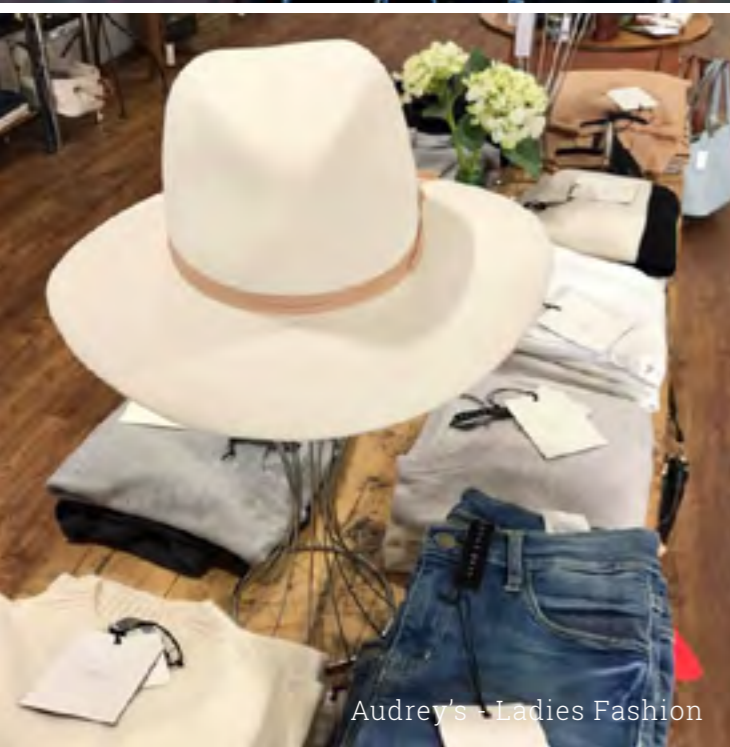
Audrey's - Ladies Fashion